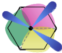
Figure 2: Beamforming can provide gain beyond that provided by a single directional antenna. More importantly, omni and wide directional antennas are inefficient because power is distributed where it isn't needed and create interference for unintended users.

Figure 2 indicates that beamforming provides additional gain beyond what a wide-angle directional antenna provides. Although this gain can be meaningful, the significant benefit is a reduction in interference to others. As depicted in Figure 3, by limiting the interference energy directed to other users, and in some cases actively nulling this interference, the improved SINR can be achieved without reducing the spectral efficiency. Also, since the users are randomly spread, there is additional interference diversity gain as the beams track users.